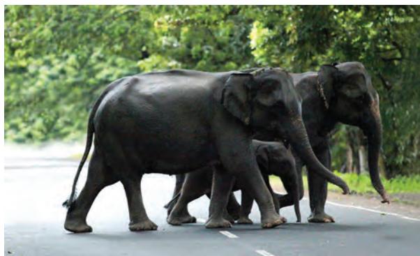
Fig. 12.4 : Elephant

Wild elephants feed on agriculture crops, seeds, barks, leaves, grasses and trees. They use their tusks to pull out the bark from trees and dig roots out of the ground. They trample crops and damage crop fields. Also elephant cause damage to crops both in pre harvest and post harvest condition.