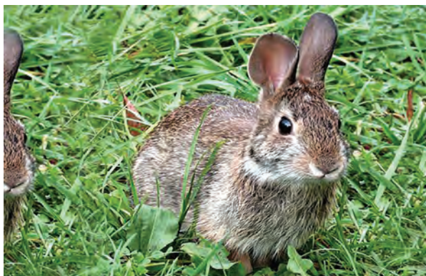
Fig. 12.8 : Rabbit

Wild rabbits cause severe damage to crops. The main predator of rabbits is fox, while young rabbits also fall to bird attack as prey.