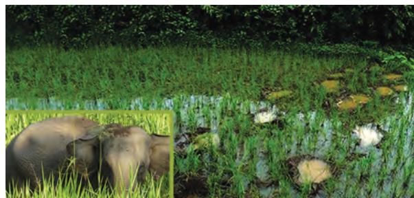
Fig. 12.5: Damage by elephant