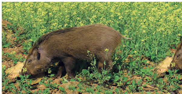
Fig. 12.2 : Damage by boar