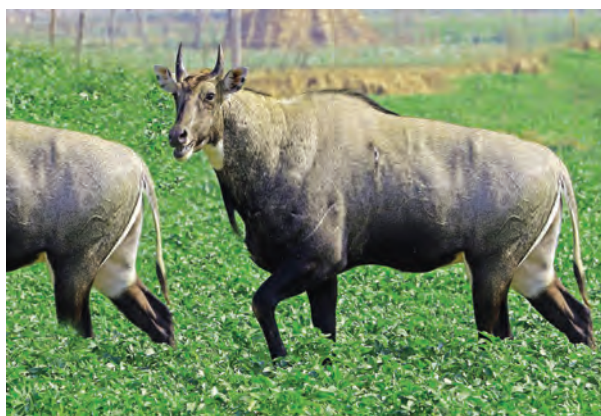
Fig. 12.7: Blue bull