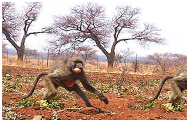
Fig. 12.3 Damage by monkey