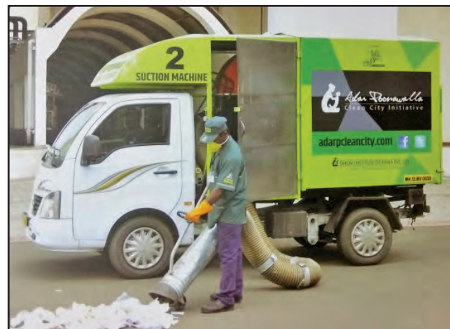
Garbage Collection Machine