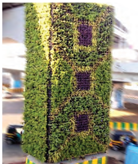
Fig 3.3 : Vertical garden