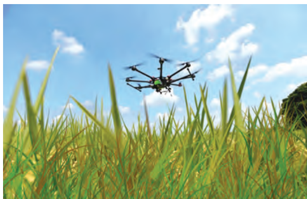
Fig 3.1 : Use of drone for spraying operation

Foliar application of inputs like pesticides, fertilizers, growth regulators, weedicides, etc. is not only expensive but also full of risk for the operators. Restrictions in spraying due to wet soil, densely populated crops like sugarcane, can be overcome by the use of drones. Drones may be operated by remote control or by programming with GPS parameters. It is going to be a new opportunity of employment to provide drones on rent or contractual system.