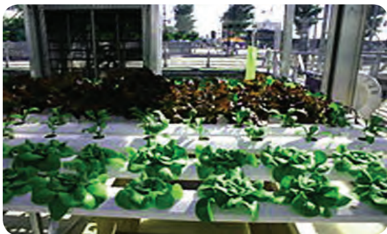
Fig. 3.5 : The nutrient film technique being used to grow various salad greens