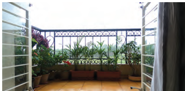
Fig 3.2 : Terrace garden

Because of crowding, pollution and hectic lifestyle, urban people are always in search of a hobby which can give scope for their creativeness and feel pleasure. Most of them have affection towards agriculture. But they have no agricultural land or other facilities. Novel concept of vertical gardening allows such people to grow flowers, vegetables and fruits also in their balconies, terrace, common places, etc. Use of cocopeat, hydroponics and aeroponic technologies are also adopted in urban agriculture. Municipal corporations, railway, corporate buildings, apartments, etc. are now covering their walls, pillars and terrace by vegetation. Here cocopeat is used as media for growing, as it is light in weight and having higher water holding capacity. Vertical gardens are expensive as compared with ground-level gardens. It requires panels and framework, specially designed pots, irrigation system and maintenance.