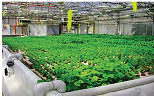
Fig 3.4 : Static solution culture

In static solution culture, media solution is stable in the container. Particular level is maintained to keep some of the roots exposed in air for availability of oxygen or the solution may be aerated by using aquarium aeration pump system. When concentration of nutrients in the solution is decreased, new solution is added or previous one is replaced periodically. Static solution hydroponic method is generally followed for home scale or small units.