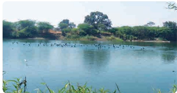
Fig. 10.2 Agrotourism Activities