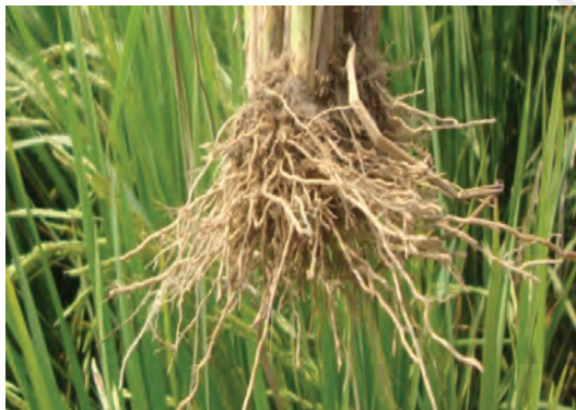
Fig. 4.1: Root system

It is necessary to understand the growth and development stages of a paddy plant. As management practices like weeding, irrigation, fertiliser application, etc., are almost linked with the growth and development of the plant, an understanding of the plant's growth pattern is, thus, essential. Paddy plant passes through a number of growth stages, starting from germination to maturity. Before going into details of the growth stages, it is important to understand the morphology (external appearance) of the plant.