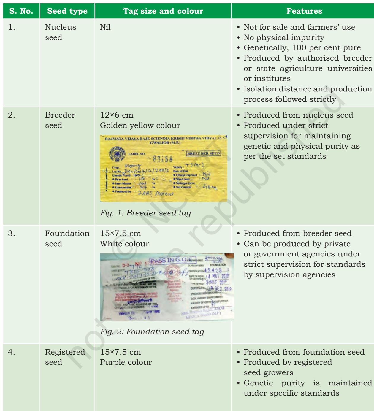
Fig. 1: Breeder seed tag