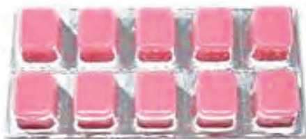
Fig. 5.8 Chews

Taffy or chews are a type of candy that is made by stretching and folding a sticky product for many times. The sticky product is prepared