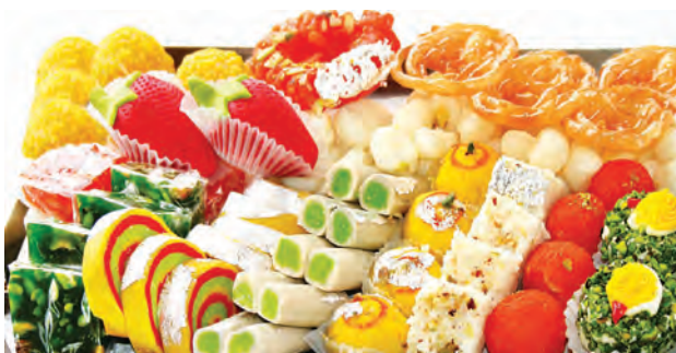
Fig. 5.12 Mithai

Mithai is a generic term for confectionery in India. It is typically made from dairy products and/or some form of flour. Sugar or molasses are used as sweeteners.