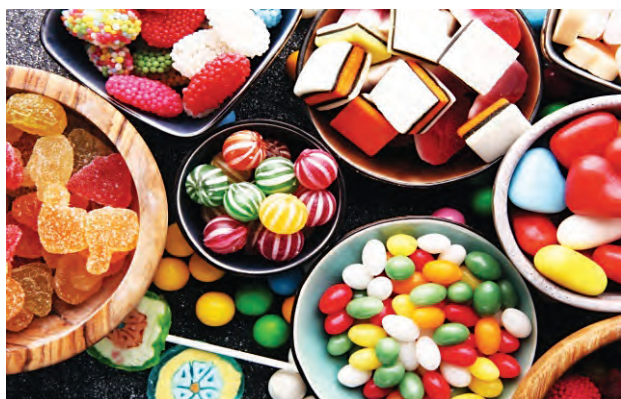
Fig. 5.1 Confectionery products

The Indian confectionery market is changing rapidly in terms of trends and consumer behavior pattern. Various multinational companies have entered in the Indian confectionery market by launching new products at affordable prices, wide varieties and addressing the nutritional concern. This has led towards an increased per capita consumption at about 2.3 kg in 2019.