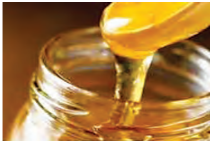
Fig. 5.14 Invert syrup

Invert sugar syrup can be prepared by heating sucrose (sugar) and water together by adding edible acid (citric/tartaric/acetic/ lemon juice) or an enzyme (invertase) upto thick consistency.