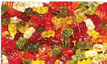
Fig. 5.9 Gelatinized sweets

This group contains the products from hard gum to soft jellies. They are prepared by combining sugar, glucose syrup and gelling