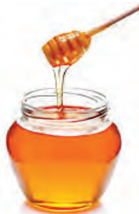
Fig. 5.16 Honey

Honey is natural invert sugar. It is rich in fructose and is used in developing low calorie confections. It contributes to the sweet taste and delicate flavour.