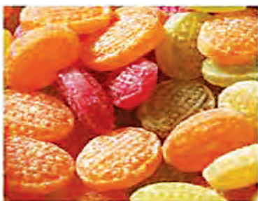
Fig. 5.7 Hard boiled candy

A hard candy, or boiled sweet, is a candy prepared from sugar and liquid glucose boiled to a temperature of about 149-166°C or to the hard-crack stage. After the syrup boiled to this temperature, then it is cooled to form a solid mass containing less than 2 percent moisture. It becomes stiff and brittle as it reaches to room temperature. Within this group a wide variety of products with different colours, flavours and shapes can be get developed. E.g. lollipops, lemon drops, peppermint drops and disks, rock candy, etc.