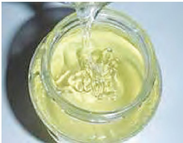
Fig. 5.15 Corn syrup

It is purified concentrated aqueous solution which is made from starch of corn. It is also known as glucose syrup to confectioners. It is used to soften texture, add volume and enhance flavour.