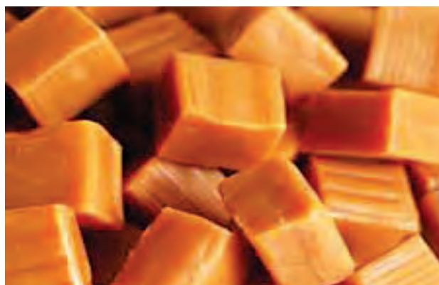
Fig. 5.5 Toffee

Toffee is made by heating process of sugar/jaggery with butter and milk solids. Toffees have lower moisture content than caramels and consequently have a harder texture. The use of fat and milk solid is less than the caramel. The final temperature reaches to about 152°C.