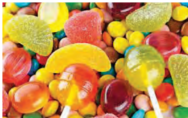
Fig. 5.3 Sugar confectionery

These are the confectionery products mainly made up of sugar added with flavourings and additives. E.g. candy, chocolate, sweet, toffee, etc.