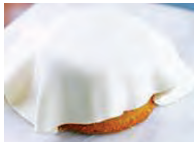
Fig. 5.10 Sugar fondant

Fondant is made by boiling a sugar solution with the optional addition of glucose syrup. The mixture is boiled to a temperature in the range of 116-121°C, cooled, and then beaten in order to control the crystallization process and reduce the size of the crystals. Creams are fondants which have been diluted with a weak