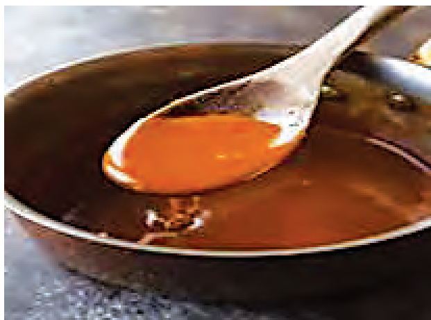
Fig. 5.4 Caramel

Caramels are derived from a mixture of sucrose, glucose syrup, and milk solids. The mixture does not crystallize, thus remains tacky. Caramels are of three types on the basis of temperature of process such as soft (118 to 120°C), medium (121 to 124°C) and hard (128 to 132°C).