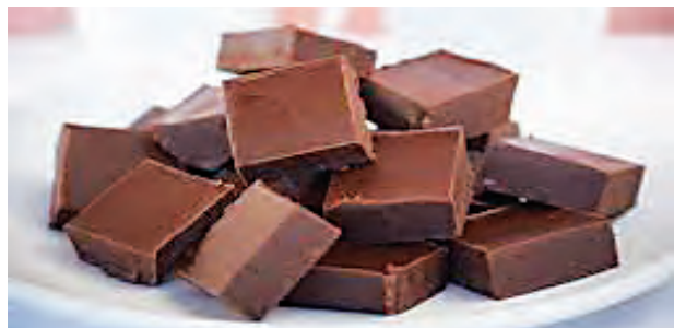
Fig. 5.6 Fudge

Fudge is made by boiling milk, butter and sugar at about 116°C so as to get a soft-ball consistency stage. While cooling the mixture, crystallization of sugar gives a coarse grain to the product. It is also prepared in chocolate flavour by adding 5 to 8 percent of cocoa syrup.