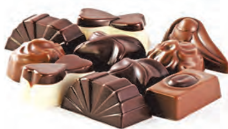
Fig. 5.11 Chocolate

Chocolate is prepared by roasted and ground cacao seeds which are further converted into powder, liquid paste and block etc. Several types of chocolate based confectionery products are prepared worldwide such as milk, white and dark chocolate etc. It is also used as a