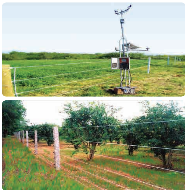
Fig. 5.2 Types of farm fencing

Certain quick growing live hedges serve the purpose of fencing viz. karwand , mehendi , ingadulcis chichbillai , babhol , ketki . These plants are thorny and their leaves withstand drought conditions; propagated easily and put up a rapid growth.