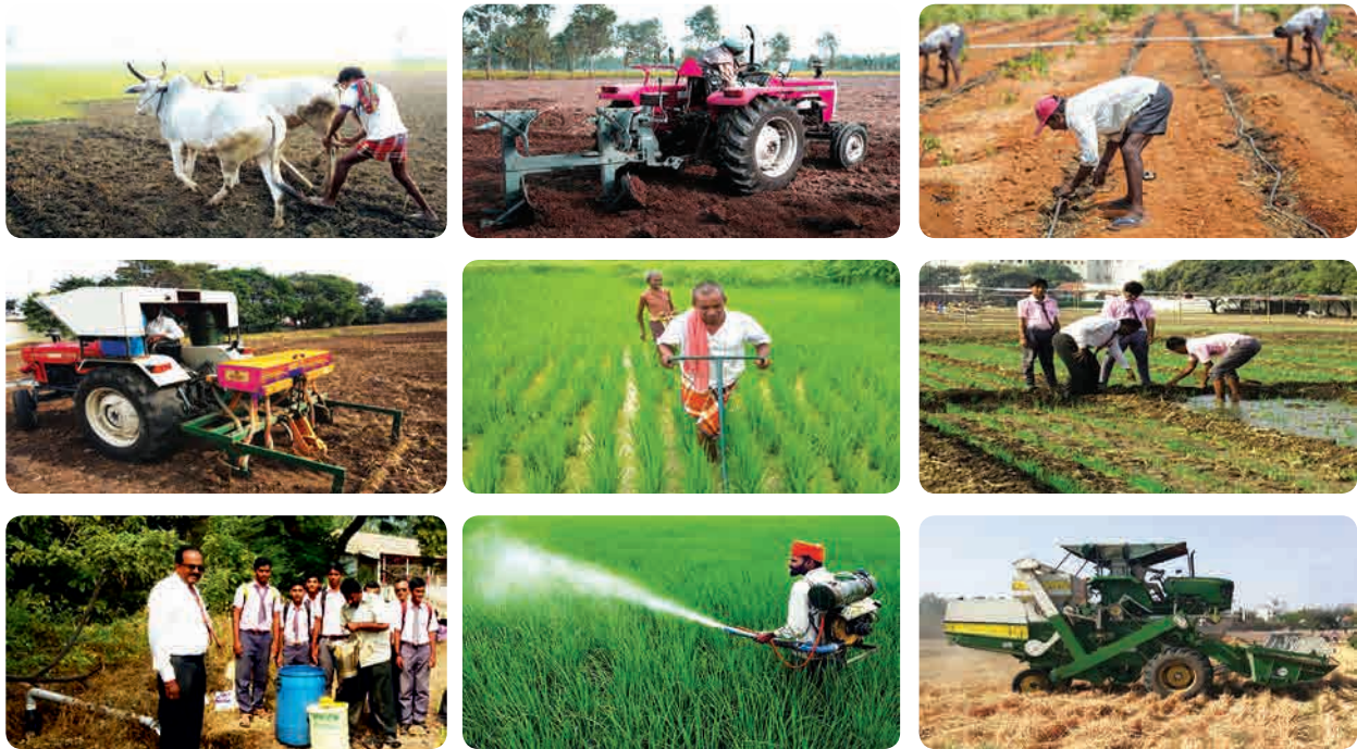
Fig. 5.3 Various farm operations