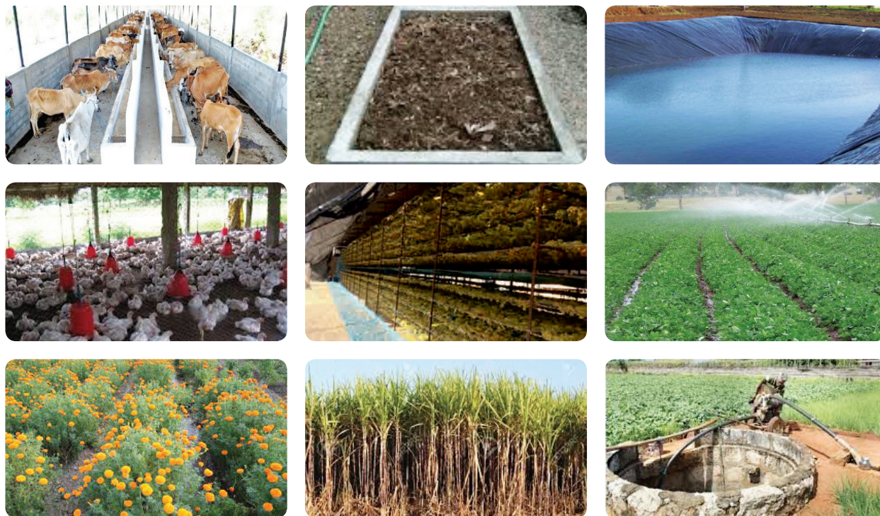
Fig. 5.1 Farm enterprises or business

f. Study of existing structures : Condition of the fencing, drainage system, bunds and farmstead, if any.