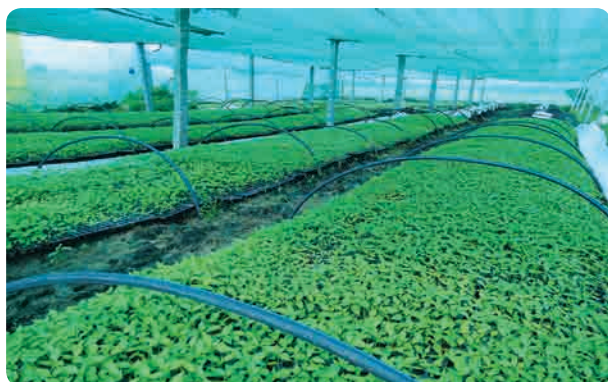
Fig. 6.4 Vegetable nursery

b. Vegetable nursery : In this nursery seedlings of cauliflowers, cabbage, brinjal chilli, onion, tomato, etc. are prepared. All vegetables except few like potatoes, sweet potato, bulbous vegetables and some other are raised by seedlings. Very few vegetables are perennials like little gourd, drumsticks,