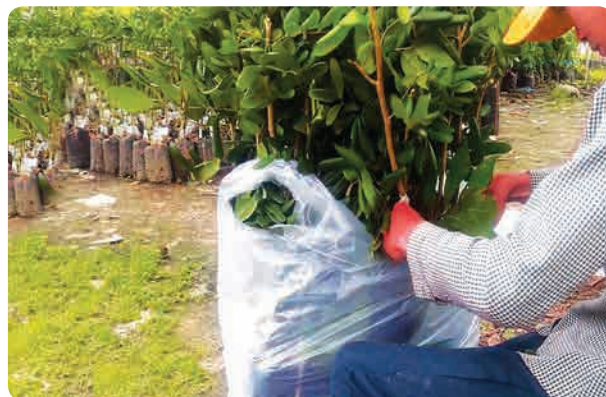
Fig. 6.12 Packing nursery plants

It should be well adapted to transport, loading with security and economy in volume and weight.