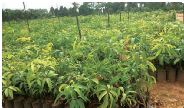
Fig. 6.3 Fruit nursery

a. Fruit plant nursery : In this nursery, seedlings and grafts of fruit crops are developed. Fruit crops are mainly propagated vegetatively and need special techniques for propagations as well as maintenance. Mango, guava, pomegranate, sapota, oranges, etc. are propagated with vegetative method. Fruit nurseries are essential for production and maintenance of grafts as well as the mother plants of scions and rootstocks.