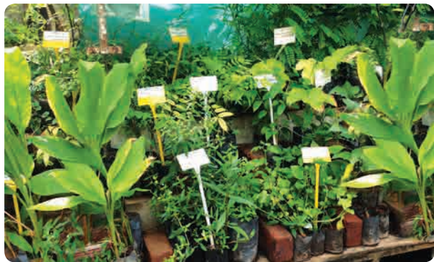
Fig. 6.7 Medicinal plant nursery

in more demand for medicinal plants, e.g. shatavari, alovera.