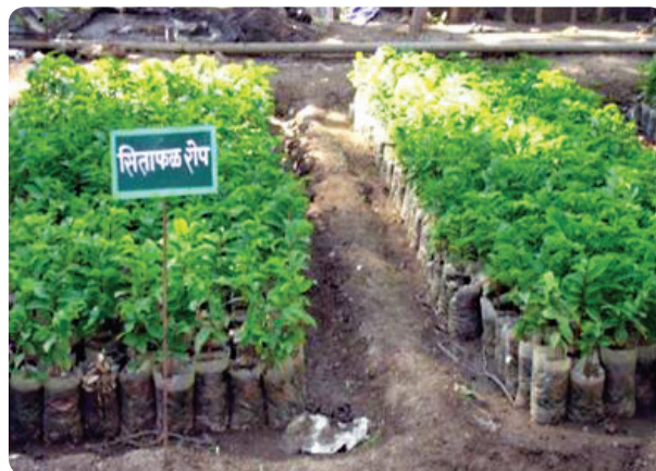
Fig.6.2 Permanent nursery

all the permanent features. The permanent nursery has permanent mother plants. The work goes on continuously round the year in this nursery.