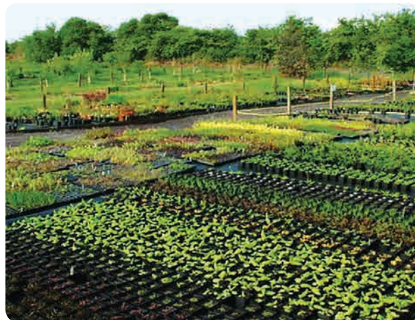
Fig. 6.10 Nursery bed

B. Seed beds : Seed beds can be accommodated in a comparatively smaller area. They should be nearer to a source of water and to the office so that they can be kept under proper vigilance. The beds should be raised enough to avoid water stagnation due to rain and excess watering. Seed beds should be located in an open place for better germination of seeds and to avoid infection of ‘damping off’ disease. Nursery beds can be prepared in three different ways as sunken beds, level beds and raised beds.