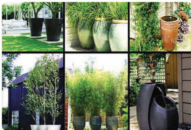
Fig. 6.11 Pot yard

D. Packing yard and working shed : The packing yard is used for packing the plants before sale or dispatch to outstations. The yard can be combined with working shed. In packing yard, there should be plenty of space to enable a number of workers for sorting out and packing the plants with ease.