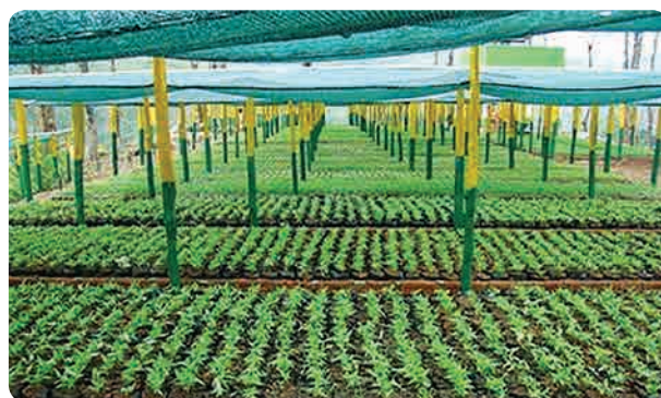
Fig. 6.6 Forest nursery

d. Forest nursery : The seedlings of plants useful for forestation like pine, oak, teak, eucalyptus, casurina, etc. are prepared and sold.