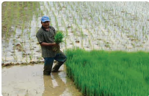
Fig. 6.1 Temporary rice nursery