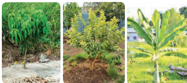
Fig. 6.9 Mother plants