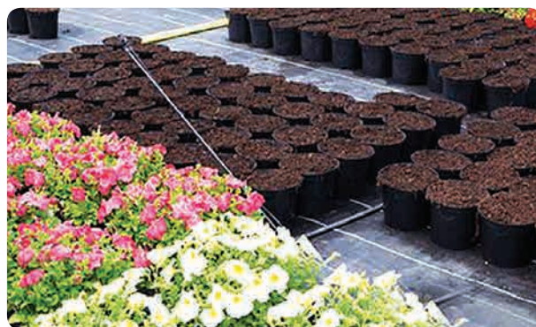
Fig. 6.5 Ornamental and flower plant nursery

c. Flowering plants nursery : The seedlings of flowering plants like merigold, carnation, petunia, salvia, rose, chrysanthemum, coleus, aster, dianthus, etc. are developed in these nurseries. Ornamental and floricultural crops are numerous and are propagated vegetatively, like gladiolus, carnation, roses, lilies etc. There is a large group of ornamental plants. It is propagated by seeds and seedling; eg. asters, marigolds, salvias, etc.