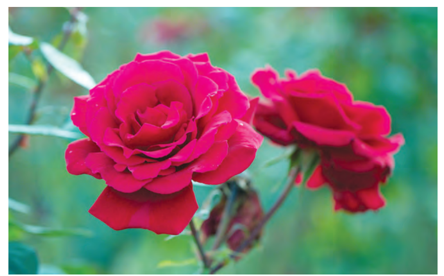
Fig. 2.1: Rose

rose water, and gulkand . Its hips contain three times more ascorbic acid than that in oranges and about seven times more than tomatoes (Fig. 2.1).