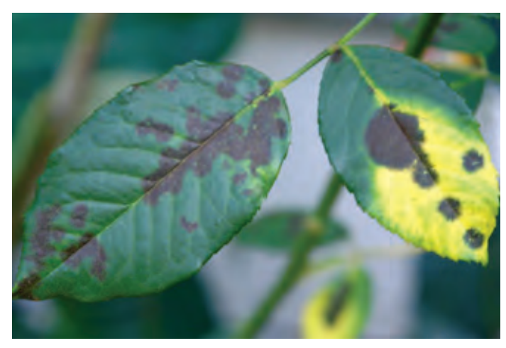
Fig. 2.4: Black spot

It occurs on rose leaves in the form of diffused purpleblack blotches which causes the leaves turn yellow and fall premature. Species roses also show small spots on their stems which may afterwards enlarge and coalesce. Occurrence of early spots on the leaves weaken the plants severely. The fungus overwinters on fallen leaves, on the bud scales, and on stem lesions. Proper sanitation should be maintained, and stems showing lesions should be pruned in spring, followed immediately by spraying of fungicides such as carbendazim, copper with ammonium hydroxide, mancozeb, penconazole, or triforine with bupirimate. Fungicides should be used repeatedly until it is completely eliminated.