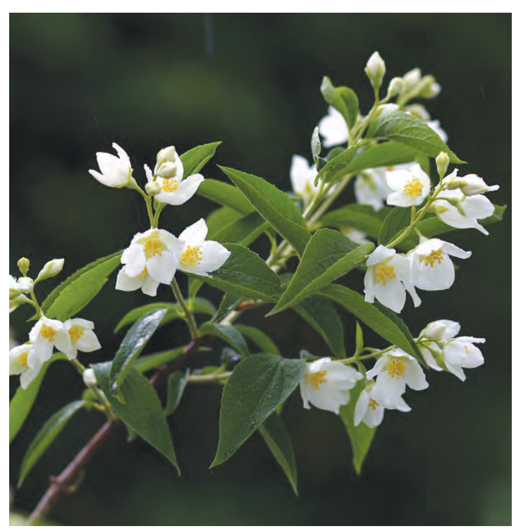
Fig. 2.7: Jasmine

Jasmine, a native of tropical and sub-tropical regions, is one of the most important traditional cum loose flowers, valued for its intense fragrance in the country and for extraction of essential oil. The species is available in both shrubby and climbing forms. Out of about a total of 40 species, India accounts for 20 species. Its flowers and flower buds are used for making garlands, gaira, veni. vis-a-vis for religious offerings. Their flowers also yield a high grade essential oil which is used in manufacturing perfumes, cosmetics, creams, hair oils, soaps and shampoos. From economic point of view in India, four species, viz., Jasminum auriculatum, J. grandiflorum, J. officinale, and J. sambac are the most important as these contain a high percentage of essential oil. However, J. arborescens, J. calophyllum, J. flexile, J. humile, and J. pubescens also have high ornamental value (Fig. 2.7).