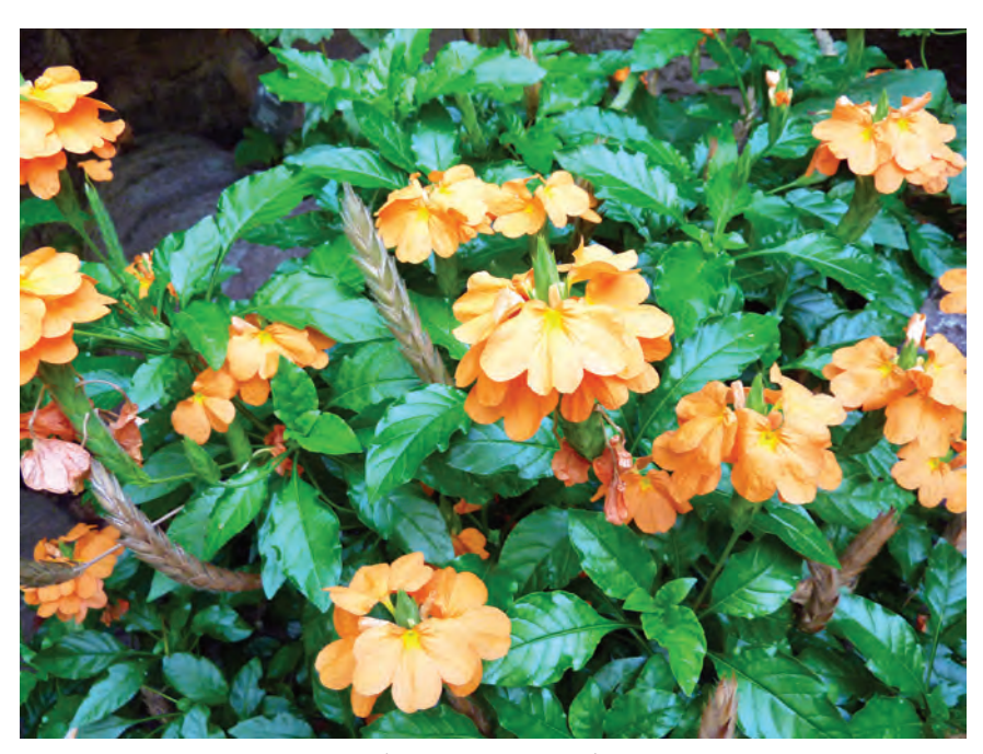
Fig. 2.8: Crossandra

low as compared to other flowers even then there is a remarkable range of colours, varying from yellow to red via pink to orange, and double coloured blue types with white throat. Recently white, light green, and violet types have become popular. Important varieties of crossandra developed by various agencies are: