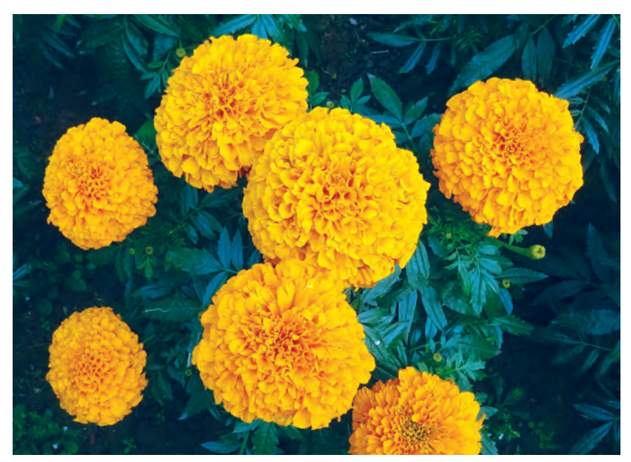
Fig. 2.6: Marigold

French marigold is comparatively shorter in height (up to 60 cm), hardy, has more branches and are bushy. The shorter ones are available which grow below 30 cm in height, coming up in globular form, full of flowers, and most suitable for edging. Its stems are reddish, leaves are dark green, and pinnately divided, and the leaflets are linear-lanceolate and serrated. Flowers are small single to double. Flowers are of yellow and orange colours in various shades and crimson, light red, bicolour such as light yellow with maroon blotches, deep crimson edged yellow, gold and red, etc.