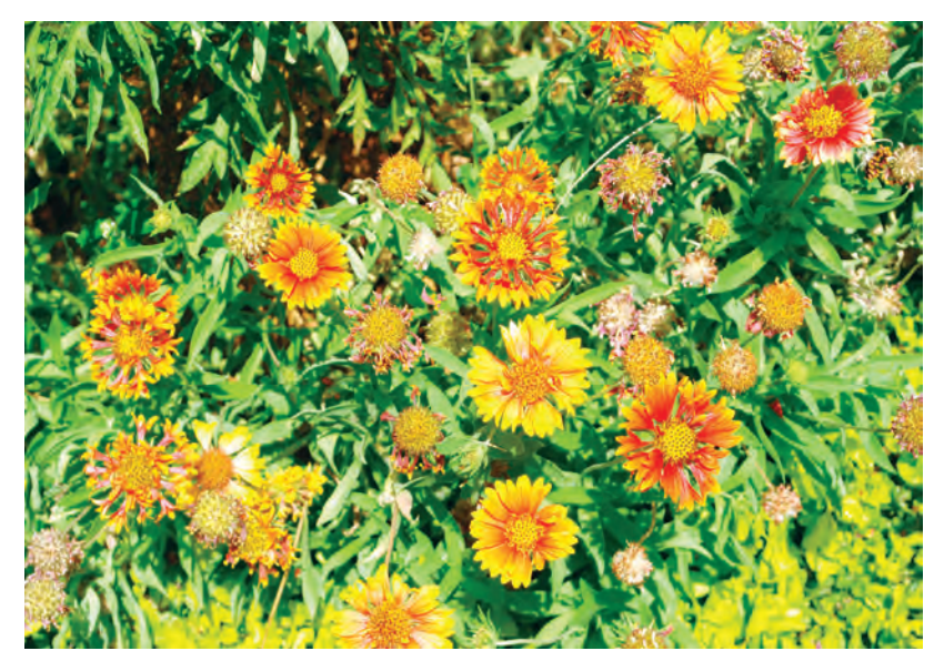
Fig. 2.5: Gaillardia

It can be grown in gardens for bedding, at borders, on window sills, in pots, and as loose as well as cut flowers. It is grown throughout the year for landscaping, garden display, and for loose flower production (Fig. 2.5).