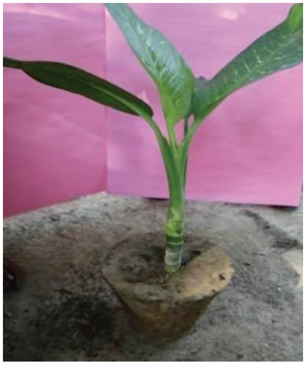
Fig. 2.11: Plant with earth ball

• The plant is placed in a new pot at the same depth in soil at which it was in the old pot. The pot is filled with fresh potting mixture, and then watered.