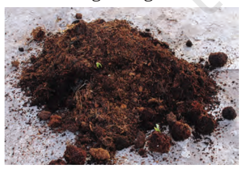
Fig. 2.5: Coco peat

It is the by-product of sawmills. It is easily available and cheap. It is poor in nutrient content but can be used after adding nitrogen.