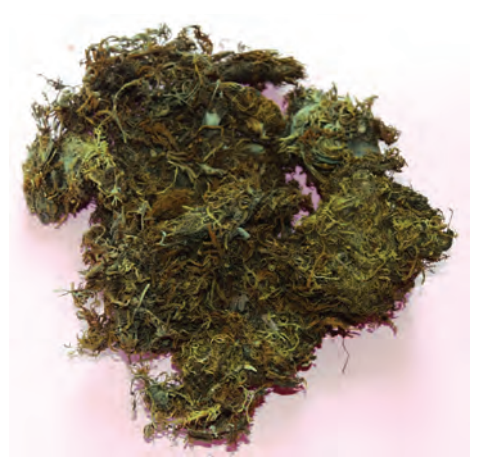
Fig. 2.3: Sphagnum moss