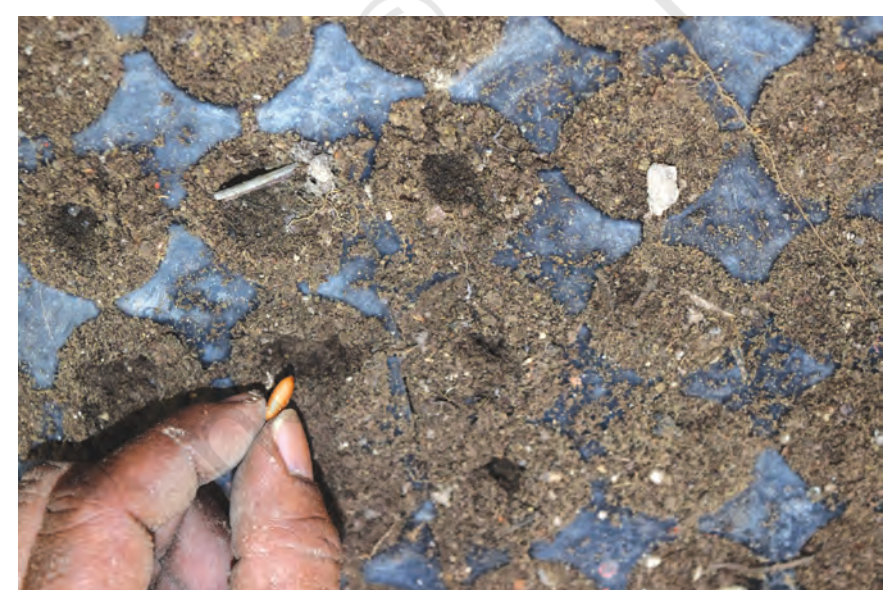
Fig. 2.7: Seed sowing in plug-trays

In this technique, plugs are filled with coco peat. Depressions of 0.5 to 1 cm are made at the centre of the plugs with the help of fingertips for sowing the seeds. One seed is sown in each plug. The seeds are placed in the depressions and covered with coco peat.