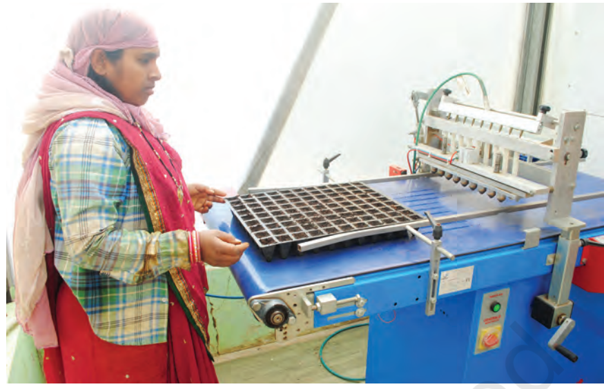
Fig. 2.8: Seed sowing by machine in plug-trays

These pro-trays are covered with a polythene sheet and kept like that for few days or till germination starts. After germination, the polythene sheet is removed and water is sprinkled with a fine nozzle can. Annual seeds are commonly sown in pro-trays filled with coco peat or other growing media.