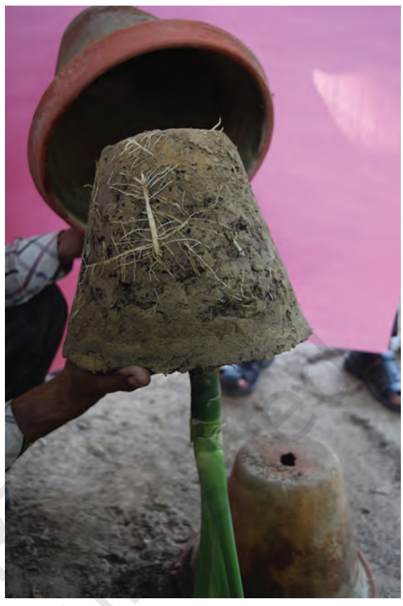
Fig. 2.10: De-potted plant