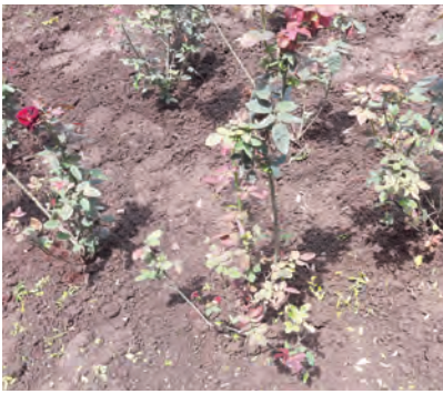
Fig. 2.1: Garden soil

The main function of growing medium is to supply nutrients, air and water to the roots of a plant. It supports the plant physically and holds it in upright position, allowing growth against the gravitational force. For the above two functions, it is necessary that the medium facilitates the growth of roots within it. The chemical composition, as well as, physical structure of the medium favours the growth of the plant. Different types of growing medium are used as per the requirement of plants.