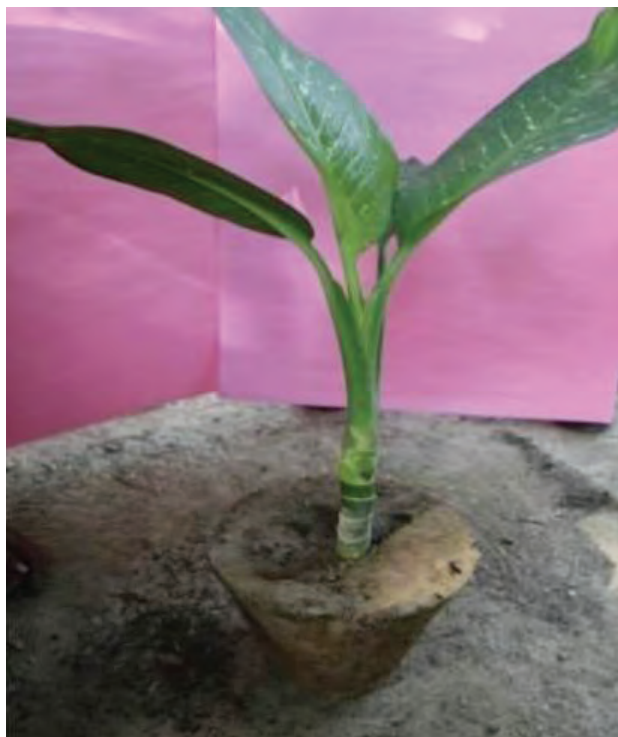
Fig. 2.11: Plant with earth ball