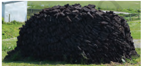
Fig. 2.4: Peat

Peat consists of residues from marsh swamp and organic nitrogen. It helps in fast vegetative growth and is commonly used for growing newly rooted cuttings or newly germinated seeds (Fig. 2.4).