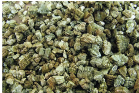
Fig. 2.6: Vermiculite