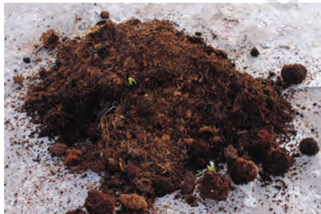
Fig. 2.5: Coco peat

It is the by-product of sawmills. It is easily available and cheap. It is poor in nutrient content but can be used after adding nitrogen.