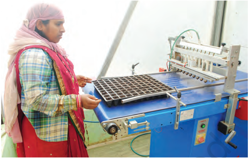
Fig. 2.8: Seed sowing by machine in plug-trays

These pro-trays are covered with a polythene sheet and kept like that for few days or till germination starts. After germination, the polythene sheet is removed and water is sprinkled with a fine nozzle can. Annual seeds are commonly sown in pro-trays filled with coco peat or other growing media.