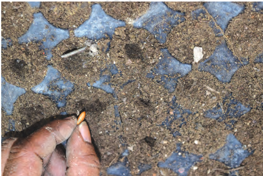
Fig. 2.7: Seed sowing in plug-trays

In this technique, plugs are filled with coco peat. Depressions of 0.5 to 1 cm are made at the centre of the plugs with the help of fingertips for sowing the seeds. One seed is sown in each plug. The seeds are placed in the depressions and covered with coco peat.