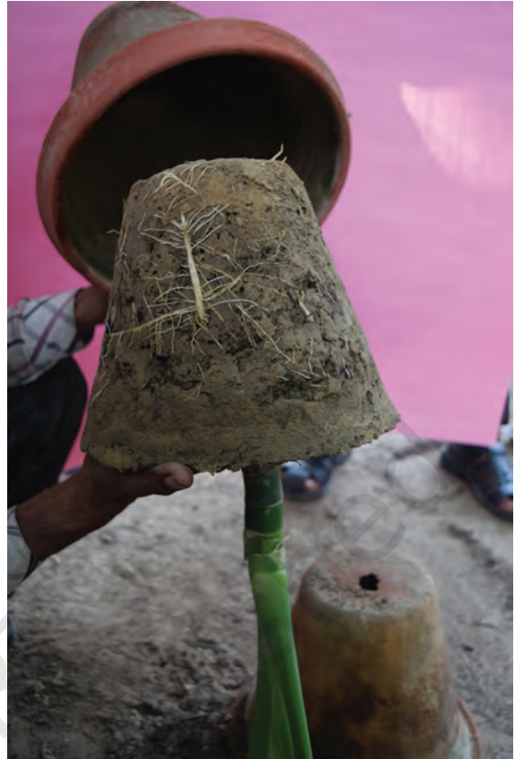
Fig. 2.10: De-potted plant