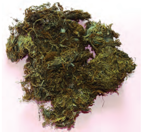
Fig. 2.3: Sphagnum moss

Commercial sphagnum moss is a dehydrated by-product of bog plants of genus Sphagnum . Commonly used moss grass is comparatively light in weight, acidic in reaction, sterile in nature and has sufficient water-holding capacity. Hence, it is commercially used as a rooting medium in air layering (Fig. 2.3).