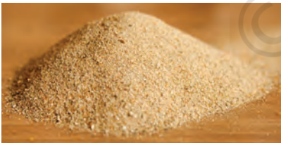
Fig. 2.2: Sand

Light and sandy loam soil must be used as growing medium, while silty or clayey soils are not preferred due to poor aeration and stickiness. The soil contains both organic and inorganic matter. When the soil is used as a medium, it may contain disease-causing pathogens, along with weed seeds, which is a serious problem in growing crops. The soil is easily available and comparatively a cheaper medium used in a nursery (Fig. 2.1).