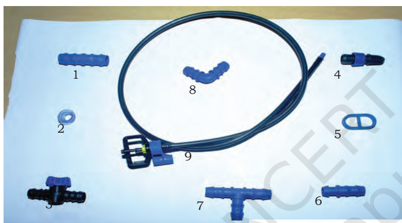
Fig. 4.2: Accessories of drip line (1) Start connector (2) Rubber grommet (3) Lateral control valve (4) Lateral end plug (5) End Cap (6) Start connector (7) Tee (8) Elbow (9) Mini sprinkler