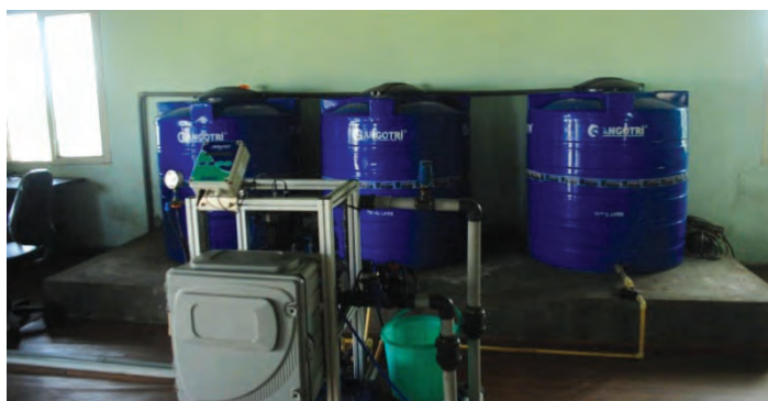
Fig. 4.8: Fertigation unit

Different types of fertiliser application systems through drip irrigation are commercially available. They are venturi, fertiliser tank and piston pump. Selection of a particular fertigation system depends on the area, flow, investing capacity and precision needed. Generally, small cultivators (up to 1008