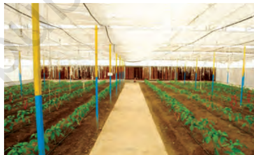
Fig. 4.1: Drip Irrigation System

The drip system should be easily serviceable, economical, user-friendly with higher emission uniformity and lower coefficient of variation, to maintain optimum moisture level in the soil. For different crops, different discharge and spacing options available in the market can be used. The diameters of laterals depend on the total discharge in specific length and frictional loss. Though there are different diameters available in the market, the most common are 12 mm and 16 mm. The discharge for closed spacing crop should be lower,