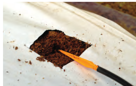
Fig. 4.6: PCCNL Dripper with Stake