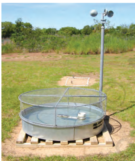
Fig. 4.9: Pan evaporation

Important terminology related to drip irrigation system is as follows.