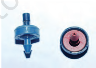
Fig. 4.5: PCCNL Dripper