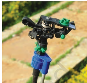
Fig. 4.7: Water sprinkler

Also, nowadays people are using sprinklers at the roof of greenhouse/polyhouse because due to dust formation at roof, the transparency of light remains lower and it helps to clean the roof. Please note that this operation should be done at night so that during sunshine, the film remains dry, otherwise there may be algae formation.